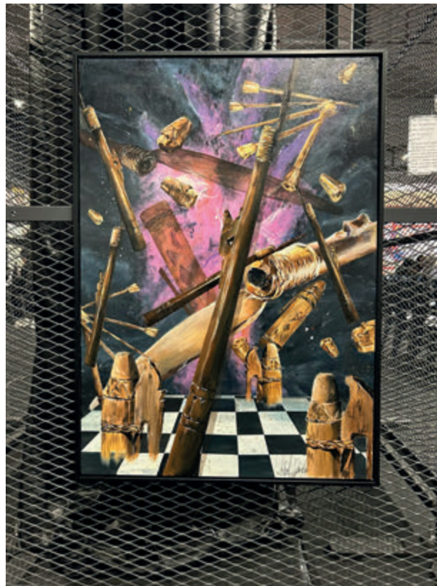
TITLE : ESSENTIAL TOOLS, IN ANOTHER REALM NAME : AFIF DANISH BIN MOMIN MEDIA : ACRYLIC ON CANVAS SIZE : 59.4 X 84.1 CM YEAR: 2024

The "Sumpit" artwork analyses the characteristics of the sumpit from Iban ethnic in Sarawak through the understanding of media dimensions. The composition and unity as fundamental to the artwork in various media beyond the 'Sumpit', a multi-disciplinary undertaking that touches both printmaking, sculpture, painting and drawing to represent aspects irreducibly Sarawakian while revealing visual appeal across such varied arenas. Indigenous artwork concentrates on shape, space reflection, and cultural purpose.