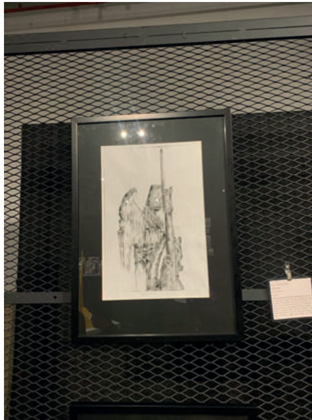
Title: Sumpit Name : Afif Danish Bin Momin Media : Intaglio Size : 42 x 59.4cm Year: 2024

Indigenous artwork concentrates on shape, space reflection, and cultural purpose.