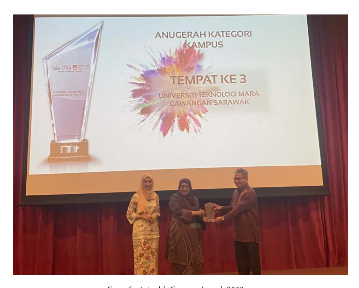
Green Sustainable Campus Awards 2022

In 2022, UiTMCS was ranked third out of all UiTM campuses for Green Sustainable Campus Awards (AKKH). The competition was organised by UiTM Green Centre (UGC). This time, the report structure focused on the most effective initiatives connected to environmental sustainability. All efforts must be recorded in the IS-CARE system, which was managed by UGC Shah Alam and should be aligned with the SDG goals. The award was presented by the Vice Chancellor of UiTM in UiTM Shah Alam.