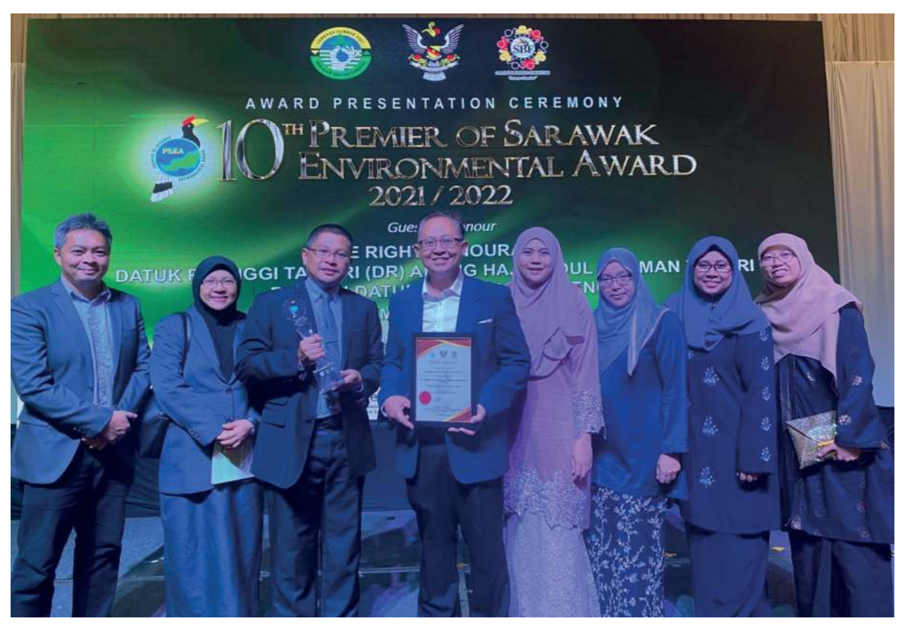
10th Premier of Sarawak Environmental Award

UiTMCS received the Gold Award for the outstanding efforts in the 10<sup>th</sup> Premier of Sarawak Environmental Award (PSEA) 2021/2022. This was UiTMCS's first entry for the prestigious competition and the award was presented by the Premier of Sarawak. It is indeed a great platform for many organisations to share their vigorous efforts in practising environmental related initiatives. The documentation and evidences presented in the report will help reveal the determination and commitment of UiTMCS in the essence of environmental stewardship.