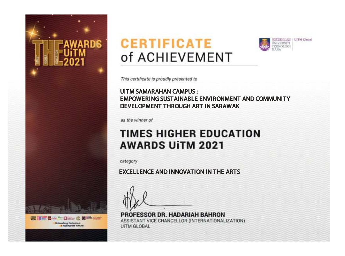
Figure 7.1 TIMES Higher Education Awards UiTM 2021

UiTMCS has received recognition for its project, Empowering Sustainable Environment and Community Development Art in Sarawak from The Times for Higher Education Awards UiTM 2021 in the category of Excellence and Innovation in Arts as shown in Figure 7.2. It was awarded as an acknowledgement of UiTM Sarawak's efforts in promoting artwork using environmental-friendly products and in contributing to the community of art development in Sarawak.