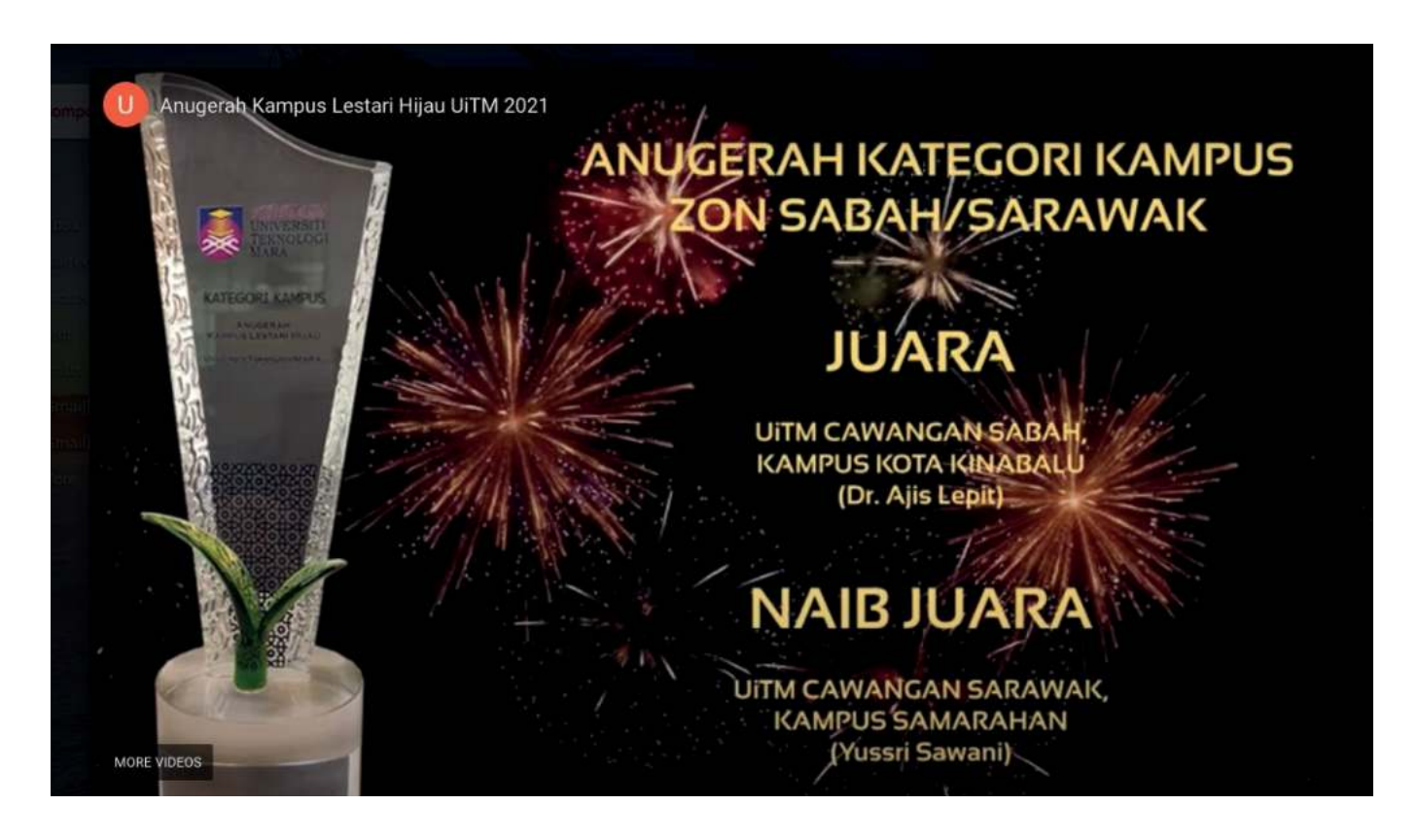
Figure 7.1 Green Sustainable Campus Awards 2021

The report of Green Sustainable Campus Awards (AKLH) 2021 presented key achievements and practices from 2019 to 2021 at UiTM Sarawak Branch (UiTMCS) in relation to sustainable efforts as shown in Figure 7.1. This report emphasizes six (6) main thrusts, namely management, infrastructure, waste, water, education, energy and transportation, in supporting the SDGs at the university level. It would be an essential reference for the management as an input for policy formulation, monitoring, and evaluation on the effectiveness of UiTMCS's green sustainable campus development programme. It was also a great starting point on the effort of getting the best position in the international UI-GreenMetric (UIGM) World University Ranking. UiTMCS has received first runner-up in the campus category for the Sabah and Sarawak zone.