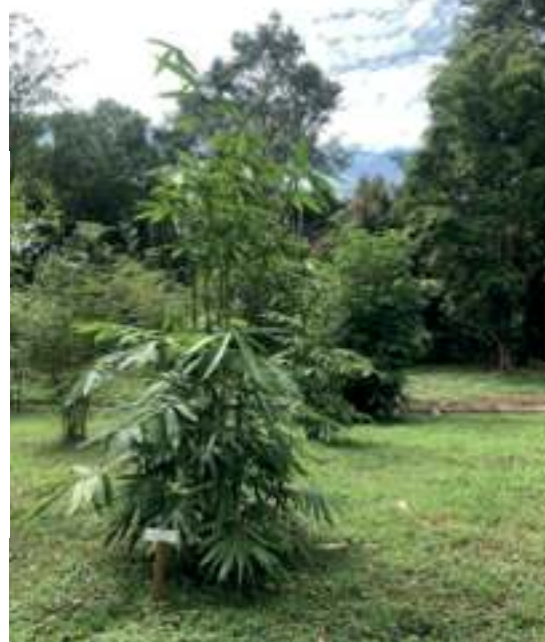
Figure 5.19 Bamboo Garden In UiTM Sarawak Samarahan Campus