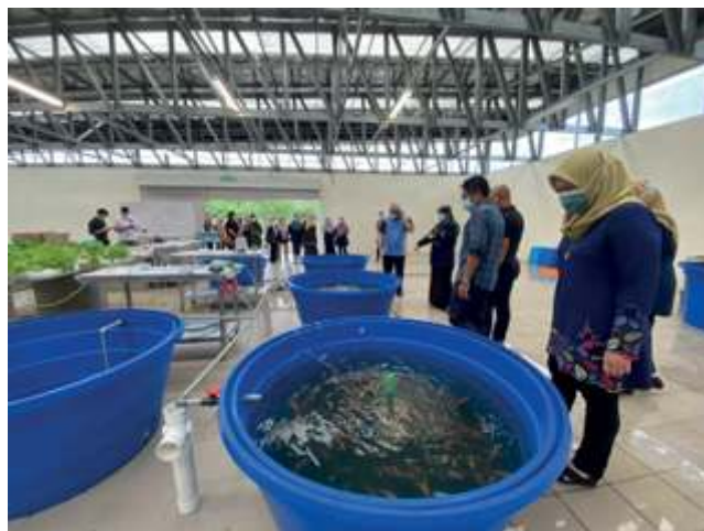
Figure 5.18 Aquaponic System Between Plant And Fish