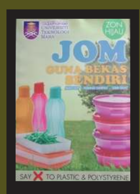
Poster Of Bring-Your-Own-Container Policy In The Cafeteria

Encourage the use of environmentally friendly food containers.