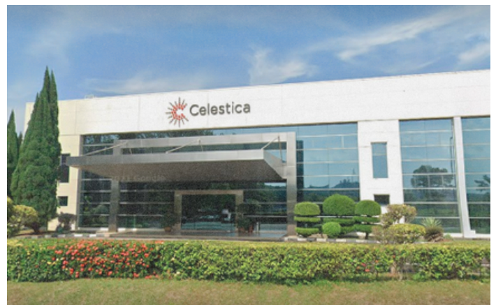
Figure 1: Celestica Kulim

Lot 15 & 16, Phase 1, 3, Jalan Hi-tech 2, Kulim Hi-tech Park, 09000 Kulim, Kedah