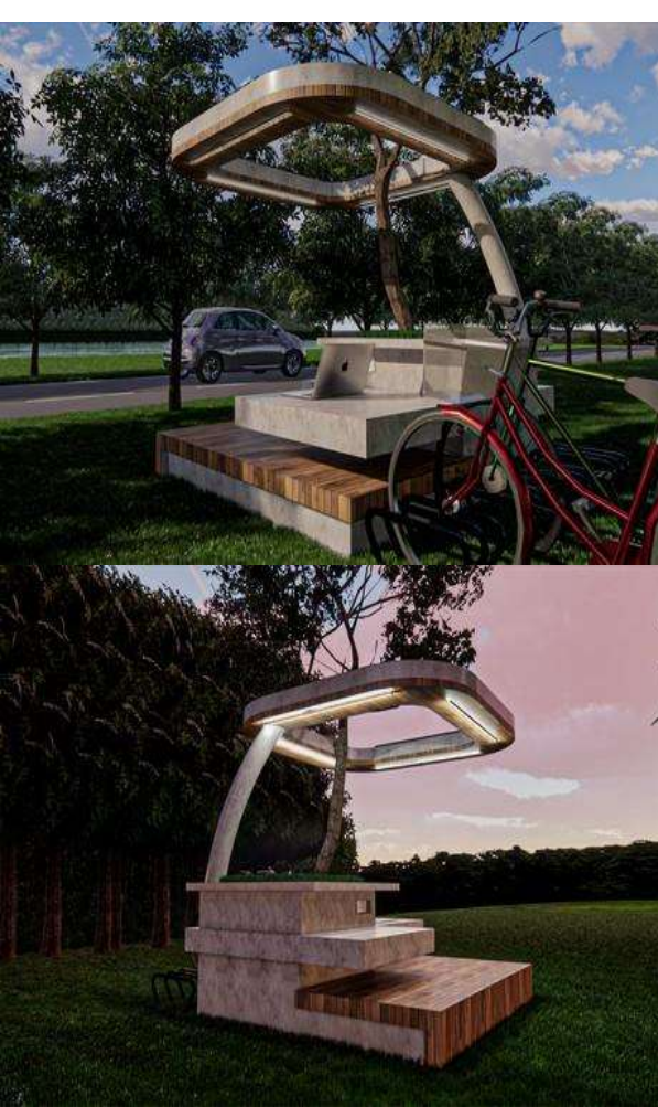
Figure 1: Zenith Oasis