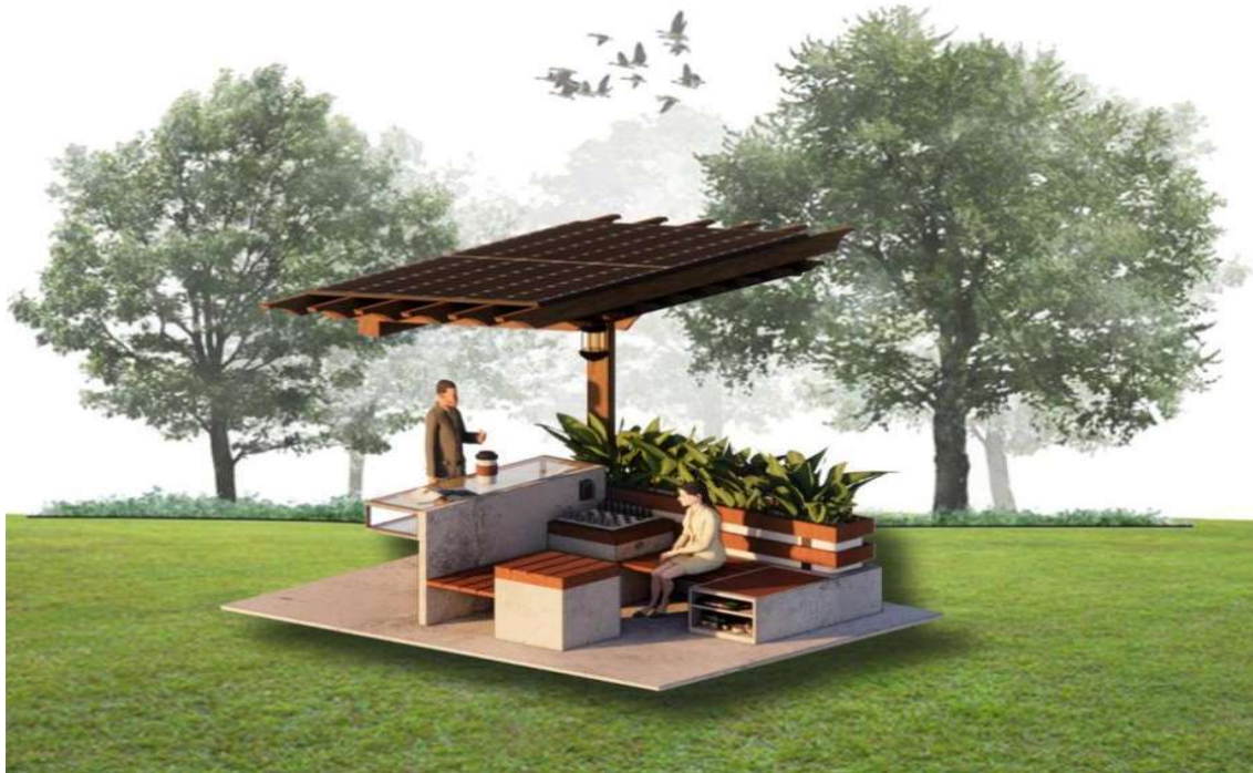
Figure 1: Meadowview Square