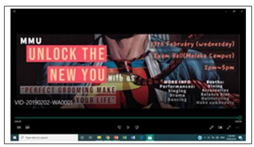
Fig. 2 Poster – Unlock the New You

They planned strategies and learned to make a decision. As a result, they feel appreciated and respected as a working adult with the trust given to them. Besides, these strategies also applied Higher-Order Thinking Skills (HOTS). HOTS learning prepared students for success in today's challenging labor force (Akhyar, 2020). HOTS is best described as the capacity to think objectively, creatively, reflectively, using metacognitive, and imaginative thought that are higher-level learning skills (Sze, 2015). The HOTS was priceless to them since they also experienced how the real worker faced a problem at work. For instance, as a boss in their own company, the boss was able to play his role to lead and manage the department. At best, the student learned to be responsible for the trust given to them. They were not punished like the lecturers punished students for misconduct but they were observed utilizing 3 methods – warning, show cause letter, and fired. Additionally, it was all done among them with minimal supervision.