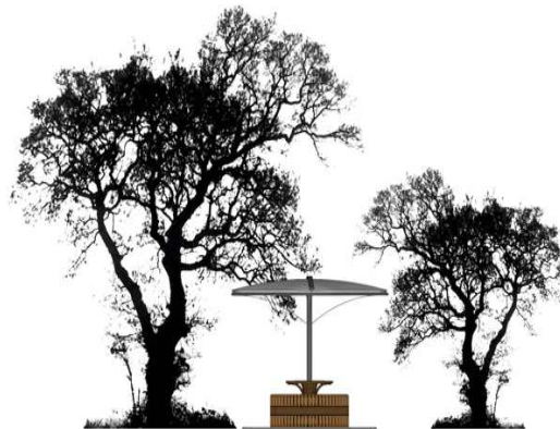
Figure 4: Side Visual faith bench