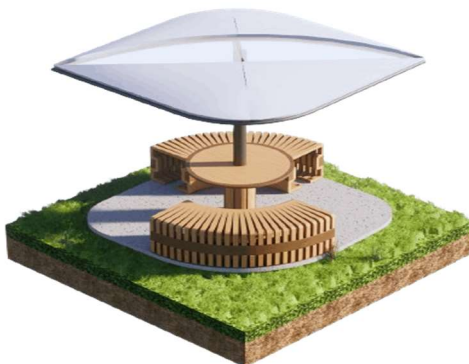
Figure 3: 3D visual render