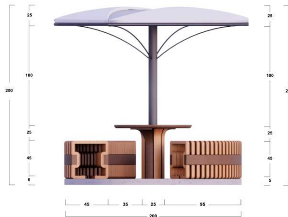
Figure 2: Schematic diagram/ dimension