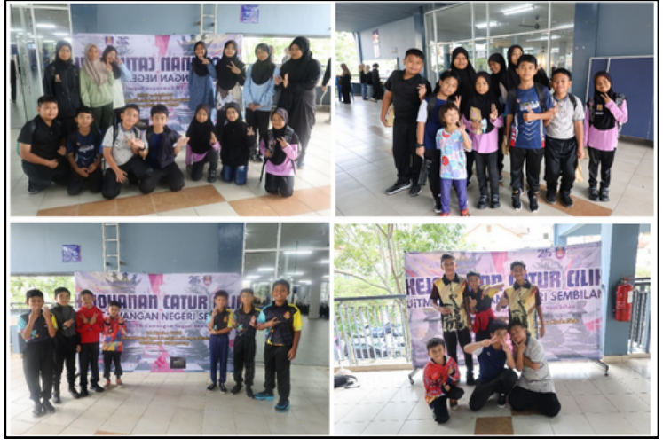
Figure 2: Participants pose for a picture before the competition begin.