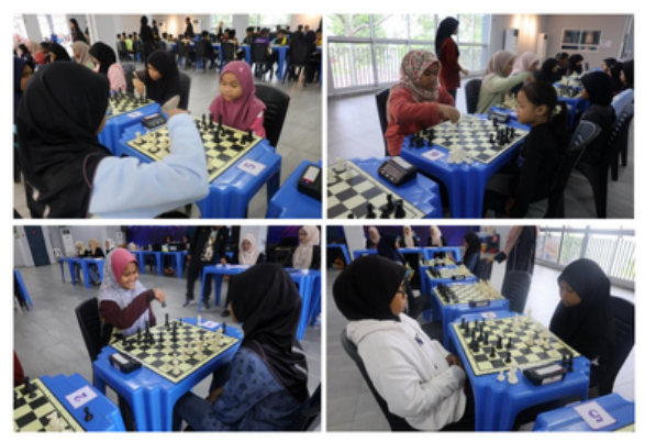
Figure 3: Participants under-12 girl category during the match.