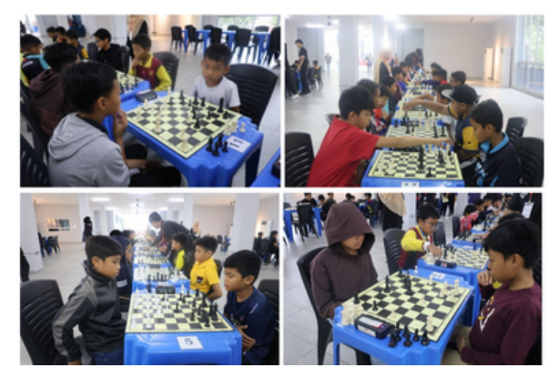
Figure 4: Participants under-12 boys category during the match.