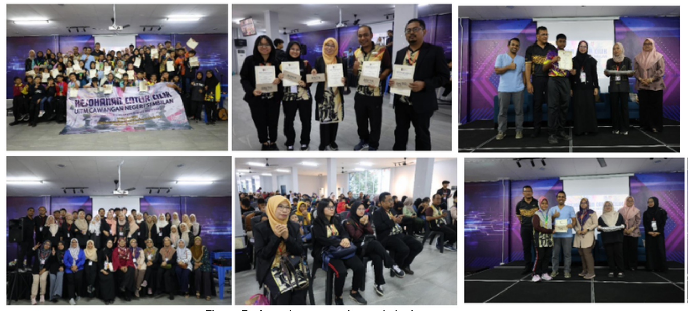
Figure 5: Award presentation and closing ceremony

In addition to the competitive aspect, the event offered participants the opportunity to engage in friendly matches, attend chess strategy workshops, and interact with experienced chess players, enhancing their educational experience. Parents and teachers appreciated the program, observing its role in building concentration skills and self-confidence among students. Some parents recommended organizing similar tournaments frequently to encourage continuous improvement in chess skills.