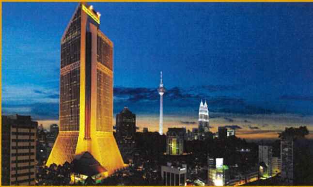
Menara Maybank, Kuala Lumpur (Main KL Branch)