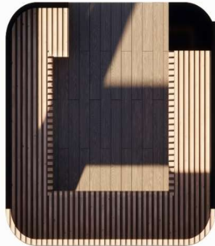
Figure 2: Layout Plan