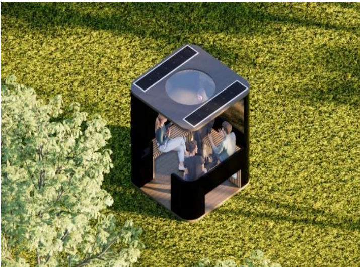
Figure 1: Perspective I