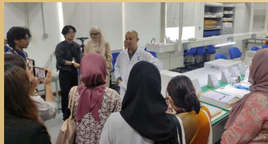
Students are listening to a briefing on the processes of conservation and preservation

Next, we were taken to the bustling working area within the preservation room. Here, we observed several staff members meticulously cleaning and addressing minor damages on records before carefully sorting them into boxes. The students were immediately captivated by the various preservation tools they had never seen before, such as bone folders, static brushes, filmoplast, and many more.