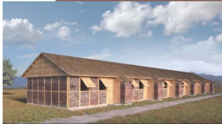
First emergency shelter prototype designed for Nepal. Shigeru Ban Architects (2015).

That being said, it is ultimately up to each and every one of us to harness the power of art and design for the benefit of society as a whole. Every single one of us, regardless of whether we are designers, artists, or simply enthusiasts of beauty and creativity, has a part to play in the process of moulding the environment that surrounds us. We have the ability to collaborate in order to build a more positive and inclusive future for all of humankind if we acknowledge the transformative power of all forms of art and design.