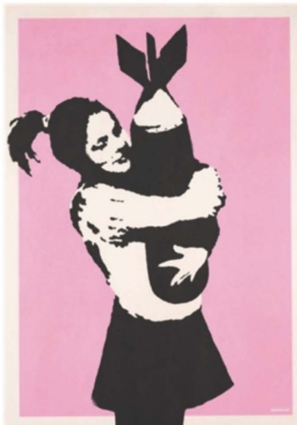
Bomb Love (aka Bomb Hugger), Banksy (1974).

In spite of these obstacles, the transforming potential of art and design continues to exist until today. It is a force that has the ability to go beyond frontiers, bridge divides, and bring people together all across the world in a common vision of a better world. Whether it be via the creation of a stunning masterpiece that brings tears to our eyes or through the design of a life-saving breakthrough that enhances the quality of life for millions of people, art and design have the ability to affect lives in ways that are both large and small.