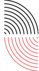
TABLE of CONTENT