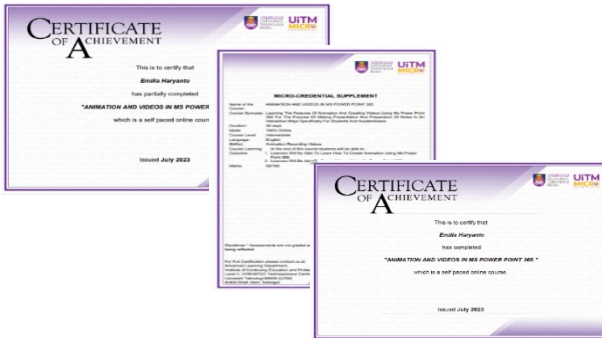
Figure 2 Partially Completion Certificate and Fully Completion Certificate achieved by students.

In the implementation phase, Beta testing was done in which students who have enrolled in the course are required to answer an online Entrance survey for a literacy test on the course. A Partially Completion Certificate will automatically be generated for students who have completed the course. However, to get a full certification, students must complete all the assessments provided. The assessments will then be evaluated by instructors and students must pass and achieve a certain range of marks for them to be awarded a Fully Completion Certificate. Figure 2 shows the sample of Partially Completion Certificates and Fully Completion Certificates achieved by students from Universitas Tanjung Pura, Pontianak, Indonesia.