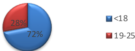
Figure 4 Respondents' background based on age.

This study involved 42 undergraduate students aged 19 to 25 years old from the Medical Faculty, Universitas Tanjung Pura, Pontianak, Indonesia. To examine the impact of the Lifelong Learning Micro-Credential Animation and Videos in MS PowerPoint courses on these students, a self-rating process was undertaken. This involved the participants completing the Entrance Survey before commencing the courses and the Exit Survey upon course completion. The online survey consists of questions about the respondent's background and the students' software literacy. The data collected from the Entrance-Exit Survey (EES) was subsequently employed to evaluate the effectiveness of the teaching and learning methods employed in the courses. Figure 4 shows the respondents' background based on their age.