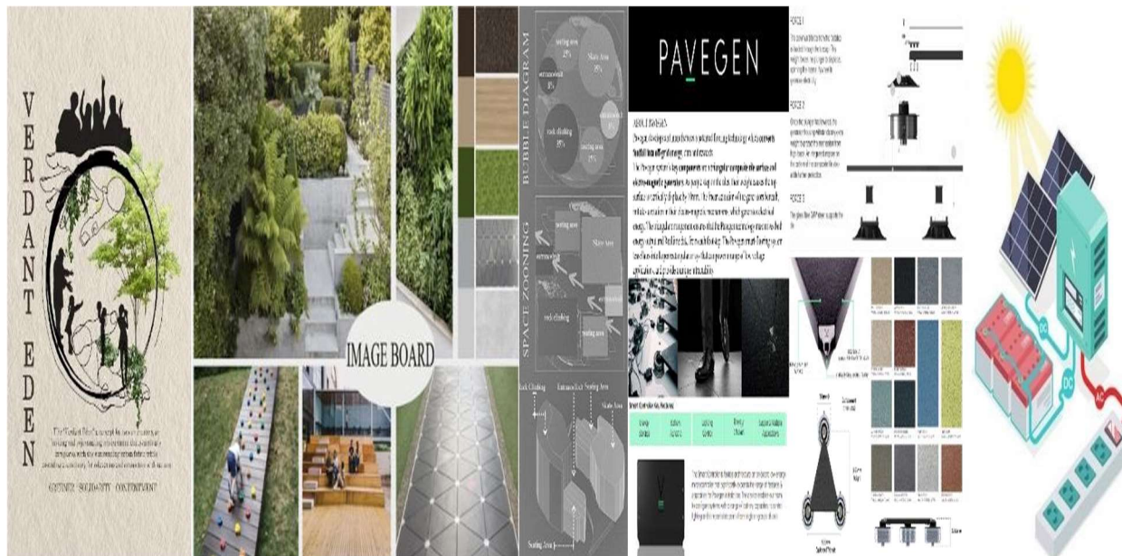
Figure 1: Design concept

Overall, the space design functionality and performance are multifunctional, supporting both passive and active uses. Transparent and semi-transparent materials in the canopies create an interplay of light and shadow, adding to its tranquil ambience. The user interface and user experience are ensured through well-placed pathways and clear signage, while elevated walkways and strategically positioned seating areas provide comfort and convenience. The space design caters to a wide range of users, including families, professionals, students, and fitness enthusiasts. Its design ensures there is something for everyone, making it a valuable addition to any urban area. Applications include relaxation and recreation, community events, and educational activities. Benefits include enhanced well-being, environmental sustainability, and community engagement. The space design is a model of innovative urban design that transforms city spaces into vital green sanctuaries, fostering relaxation, inspiration, and community engagement. By incorporating eco-friendly materials and promoting biodiversity, the park supports environmental conservation efforts and fosters social interaction and community building.