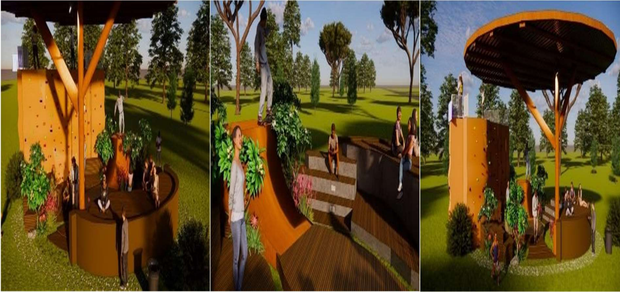
Figure 2: Verdant Eden