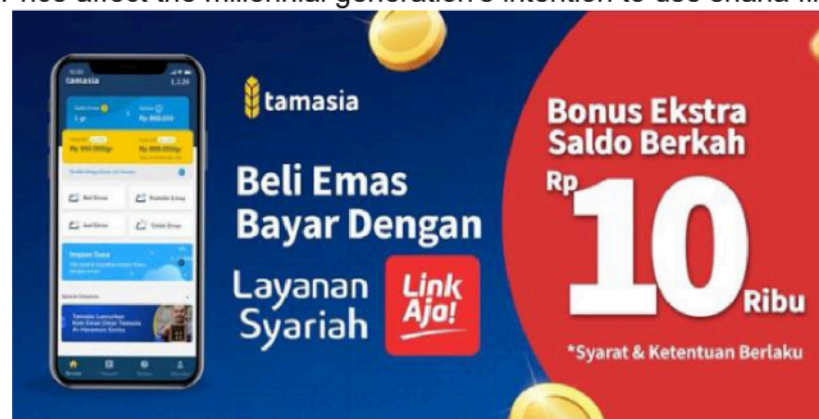
Figure 2 Promos on the Sharia Fintech Application

Palliation and Price affect the millennial generation's intention to use sharia fintech.