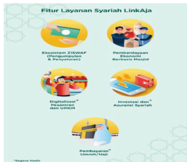
Figure 4 LinkAja Syariah application

Pedagogy and Physical Environment affect the millennial generation's intention to use Sharia fintech.