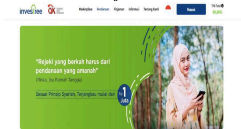
Figure 3. OJK logo on the sharia fintech website Services

Figure 2 shows sharia fintech services provide attractive offers in terms of price and provide promos such as price discounts found on sharia fintech applications and websites. These results are in accordance with the results of previous research conducted by Christiyanto and Astutik (2018) showing that Palliation and Price affect the pricing provided by Islamic banks, with these services customers will continue to use the products found in banking. Patience and Place influence the millennial generation's intention to use Sharia fintech.