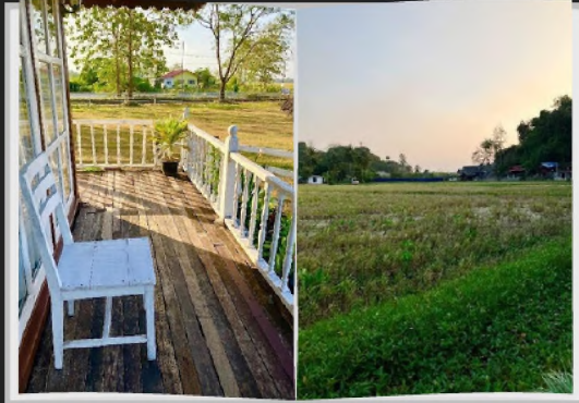
Wooden Chalet D'Solo

Perlis, despite being the smallest state in Malaysia, has a lot to offer to visitors coming to this state including its vegetation and landscapes that are rich, vibrant, and abundant in shades of green. There are many fascinating and unique homestays with picturesque views for visitors in Perlis. The three homestays that the writer has experienced herself are Harum Manis Wan Pa Homestay, Wooden Chalet D'Solo, and Kampung Ujung Bukit Homestay.