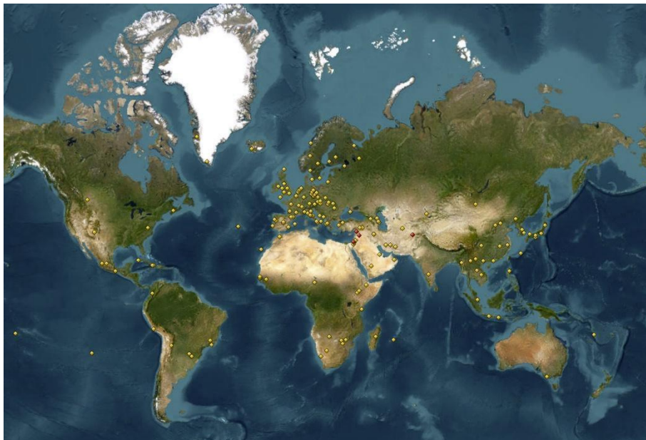
Fig. 1. World Heritage Map-cultural landscape

To fully understand the situation, it is essential to examine both the protection of cultural landscapes within China and the international context. Preserving these landscapes is vital for maintaining historical and cultural continuity and safeguarding the natural environments intertwined with them. This paper aims to enhance the understanding and protection of China's cultural landscapes by addressing three (3) key objectives: exploring the concepts and characteristics of cultural landscapes and cultural heritage, analysing the legal protection status of China's cultural landscapes while comparing typical protection measures in Asian and European countries, and identifying shortcomings in China's current protection efforts to propose actionable principles for future development. Through this comprehensive study, the research is expected to fill gaps in existing preservation strategies and provide a robust framework for ensuring that China's invaluable cultural landscapes are protected and appreciated for future generations.