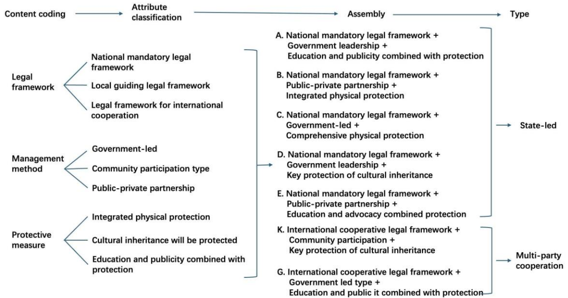
Fig. 3. Process of analysing data