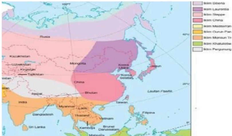
Figure 1: Climate Map (MOE, 2017)

Therefore, to develop student critical thinking on geography and interact student interest on learning related to position and direction spatially, rainfall distribution map was converted into more informative by using different colour tones and specific legends on the temperature and rainfall volume for world map as shown in Figures 2a. The elements of colours will help students' memories and stimulate their critical thinking skills by identifying the area which receiving high and low rainfall volume and climate of Asia. The colour also is representing the range of Asian temperature. Figure 2b presents the rainfall density using diamond shape in different size scale.