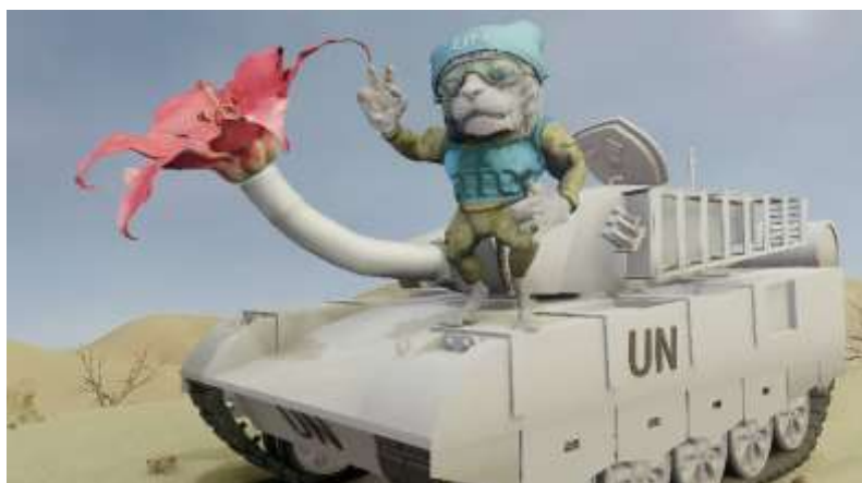
Figure 2. Peace Tiger (2022)

The Peace Tiger in 2022 (Figure 2) is part of a series of illustrations created since 2016, based on the Chinese zodiac. The creation process involves creative conception, concept drawing, 3D modelling, character rigging, and lighting rendering. Unlike conventional graphic illustration, 3D digital resources can be easily imported into 3D printing and 3D webpage modelling. The work expresses the need for sufficient peacekeeping strength and courage to defend peace, using cartoon modelling and surrealist techniques.