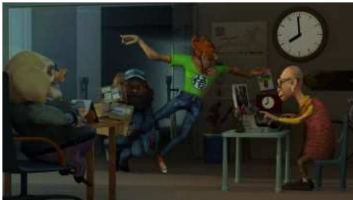
Figure 5. Journey to the Modern (2016)

The creative form was originally a CG illustration, which was fixed on the "decision moment" of the "modern version" of Journey to the West when masters and apprentices clocked in for work. Unity3D and WebGL technologies were then used to create a gamified web interactive animation, where players can interact in a variety of narrative nodes.