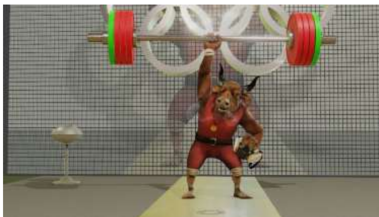
Figure 1. Olympic Bull (2021)

The Olympic Bull (Figure 1) is a transformation of the traditional zodiac sign of the Year 2021 of the Ox into an Olympic weightlifting champion. The bull, holding a gas mask and lifting a barbell, symbolizes humanity’s confidence and determination to overcome the epidemic. Cattle, revered as a totem by many ethnic groups worldwide and seen as a symbol of robustness and strength, have played a significant role in epidemic history. The animation style, created using Blender, aims to infuse the Olympic spirit into the global anti-epidemic action.