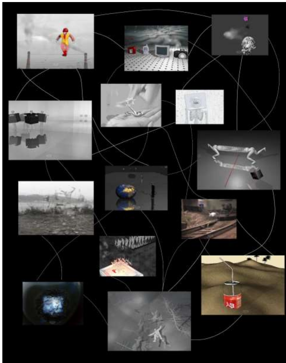
Figure 4. Dream of Life (2006)

animation represented by Flash is over, and 3D interactive engines represented by Unity are gradually becoming mainstream.