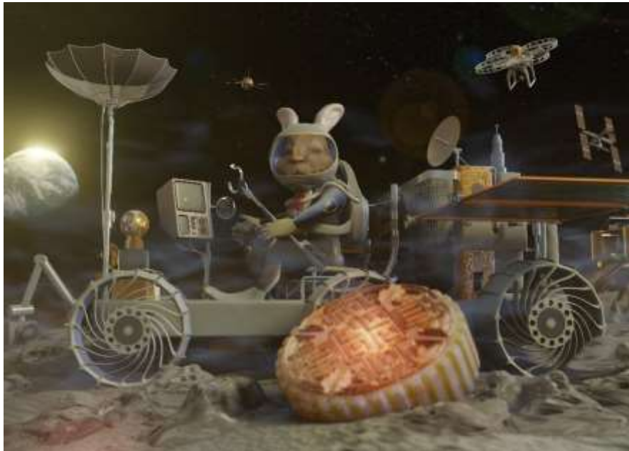
Figure 3. Moon Rabbit (2023)

The Moon Rabbit in 2023 (Figure 3) combines the lunar exploration and space theme with the Mid-Autumn Moon Rabbit shape in traditional art elements. It showcases China's significant aerospace and moon landing achievements while promoting the international spread of Chinese traditional culture using modern cartoon art techniques and three-dimensional visual language. The digital shapes in the CG illustration design are produced using open-source 3D tools, with the creative inspiration drawn from internationally renowned lunar exploration and orbiting projects such as the Chang'e lunar probe, the Yutu lunar rover, the Tiangong Space Station, and Dongfanghong-1 ground aircraft.