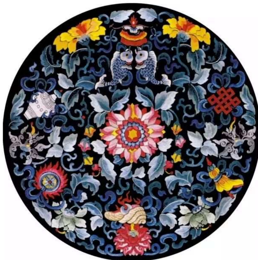
Figure 1. Traditional Chinese Embroidery

Traditional Chinese embroidery holds immense cultural significance, with each stitch and pattern conveying centuries of history and symbolism. This section delves into the roots of Chinese embroidery, exploring how cultural elements are intricately woven into the fabric of each design. From auspicious motifs to representations of nature, understanding the cultural depth embedded in traditional Chinese embroidery enhances our appreciation for its role in modern clothing design.