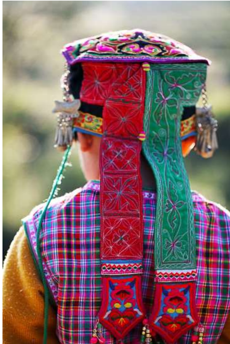
Figure 2. Traditional Dress of Chinese Southern Ethnic Groups