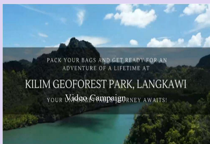
Picture 3: Sample of the video campaign done by the students for KILIM Geo-Park