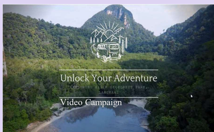
Picture 2: Sample of the video campaign done by the students for KILIM Geo-Park