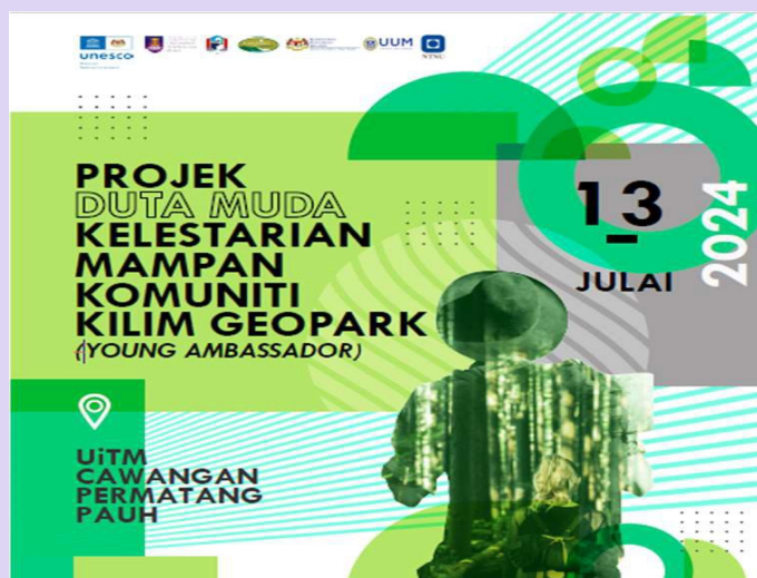
Poster of the event