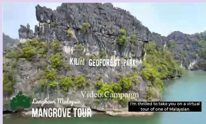
Picture 1: Sample of the video campaign done by the students for KILIM Geo-Park

Their contributions will be remembered with deep gratitude for playing a pivotal role in advancing the preservation and promotion of KILIM Geo-Park as a global model for sustainable tourism.