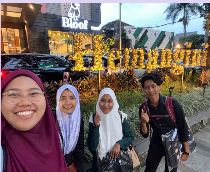
Capturing memories at Hemangini Hotel, Bandung following the ICSET 2024 conference

In such an environment, students not only acquire new knowledge, but also develop a deeper understanding of how different cultures, regions and nations approach global challenges. This encourages critical and creative thinking and enables students to approach problems with more nuanced and comprehensive solutions.