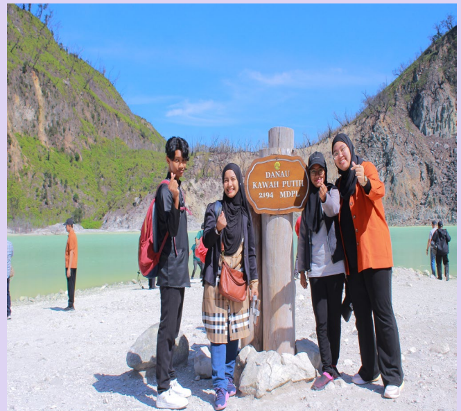
An educational visit to Kawah Putih in Bandung, Indonesia.

In addition to presenting papers at the conference, the trip gave the author and students the opportunity to explore Bandung's scenic spots. They visited Kawah Putih, a stunning volcanic crater lake, and The Lodge Woodland, a scenic destination known for its outdoor activities and breathtaking views, which enriched their overall experience.