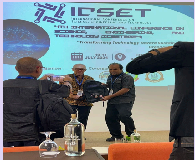
Left: Capturing a moment with participants from Malaysia, and right: During the conference opening.