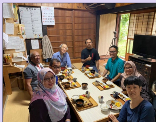
Data collection and benchmarking activities at Kyoto Homestay