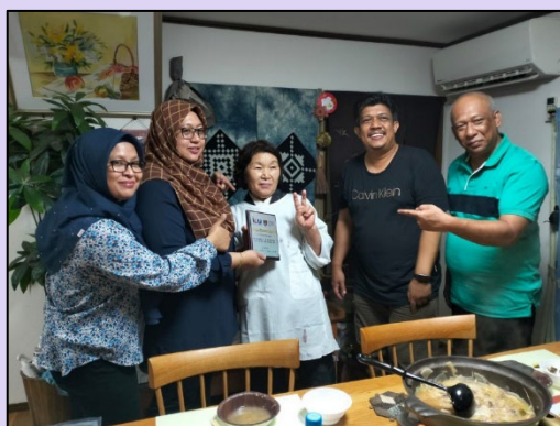
Data collection and benchmarking activities at Okayama Homestay