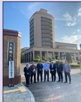
Academic visit, guest lecturer and engagement session at Osaka University of Tourism.