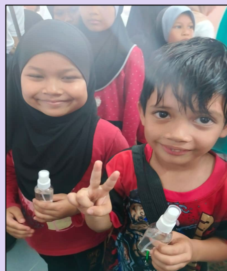
PAKK participants with self-made hand sanitiser.

This event symbolises the Faculty of Pharmacy's commitment to community service and its dedication to enhancing the well-being of children through innovative educational initiatives. By collaborating with various stakeholders and leveraging expertise from different disciplines, the faculty has demonstrated its capacity to address complex societal challenges and make a meaningful difference in the lives of others. Furthermore, the international dimension of this event amplifies its significance on a global scale. The participation of academic staff and students from Indonesia not only enriches the cultural exchange but also fosters cross-border collaboration in addressing societal challenges. This intercultural dialogue and cooperation are essential pillars in building a more interconnected and empathetic global community.