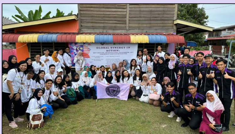
Participants of CSR "Nurturing Children's Health through Pharmacy Education and Community Gardening" at Pusat Aktiviti Kanak-Kanak (PAKK) Kuala Muda.

The Faculty of Pharmacy, UiTM Pulau Pinang Branch (Bertam Campus) in collaboration with the Special Interest Group (SiG) Social Organisation Cultivation Love for Children (SOLID) from the Department of Business and Management at UiTM Pulau Pinang Branch successfully organised an international community service (CSR) initiative titled "Nurturing Children's Health through Pharmacy Education and Community Gardening" at Pusat Aktiviti Kanak-Kanak (PAKK) in Kuala Muda . This event, held on 22 November 2023, was part of a three-day academic visit to UiTM, welcoming around 70 academic staff and students from 35 institutions across Indonesia . The main beneficiaries of this initiative were approximately 30 children from PAKK.