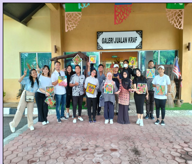
Participants learning about batik at the Handicraft Development Corporation of Penang, Bertam