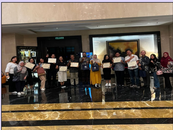
Bali Tourism Polytechnic Summer Camp Certificate Giveaway Ceremony at the Light Hotel Penang