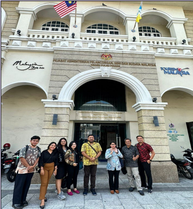
An insightful visit to the Ministry of Tourism, Arts and Culture, Georgetown, Penang