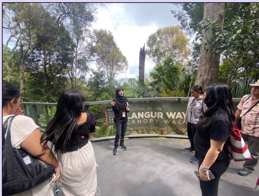
Participants listening to the tour guide at the Habitat, Penang Hill

With hearts full of cherished memories, minds enriched by newfound wisdom, and strengthened bonds across borders, the participants returned home forever connected to Penang's vibrant past and heritage.