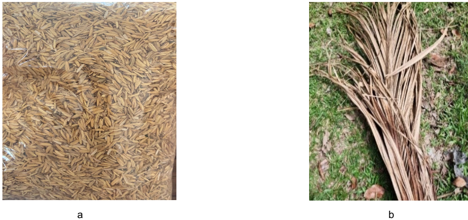
Figure 1. Paddy husk (PHU) (a) and Dried coconut leaves (DCL) (b)