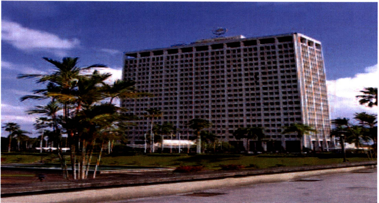
Wisma Bapa Malaysia, current office for Sarawak Civil Service