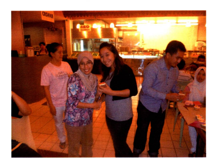
Token of Appreciation ceremony