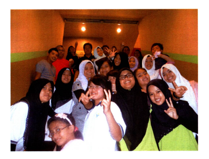
Farewell Dinner at Bimmer's Steamboat