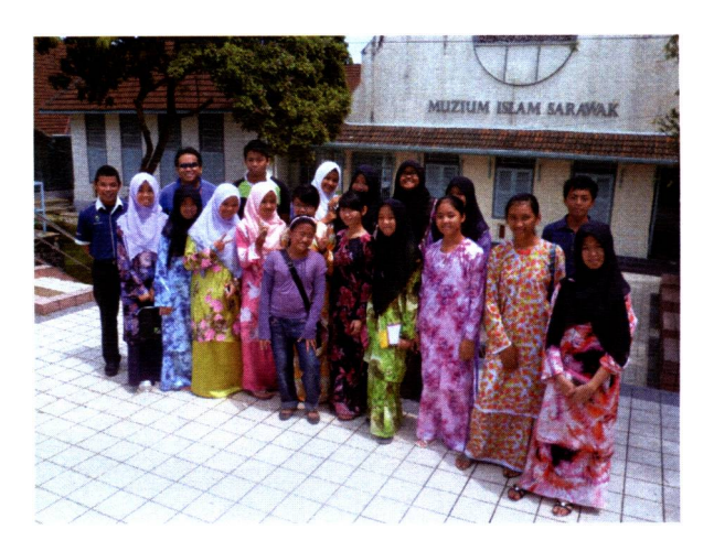
Educational Visit to Islamic Museum