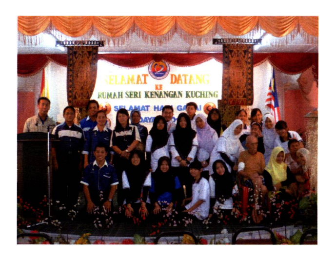
Community Service at Rumah Seri Kenangan