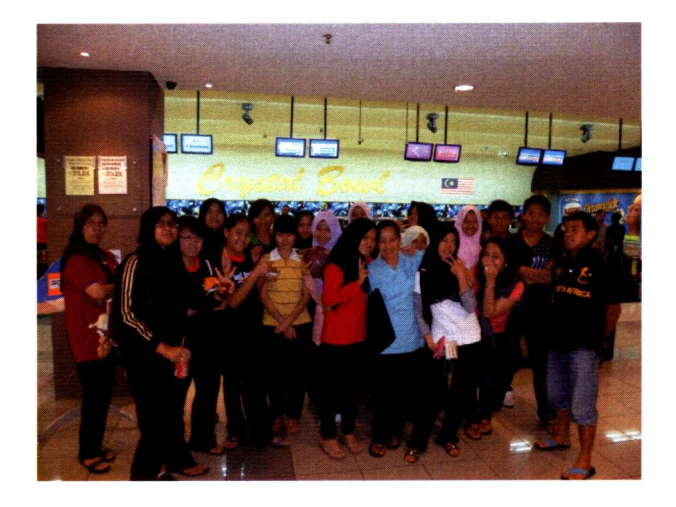
Bowling Tournament between facilitators and participants