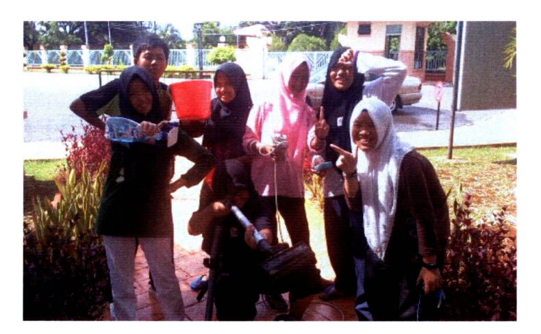
Community Services at Yayasan Sarawak