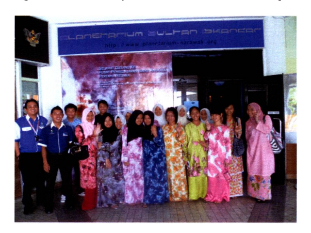
Educational Visit at Planetarium Sultan Iskandar