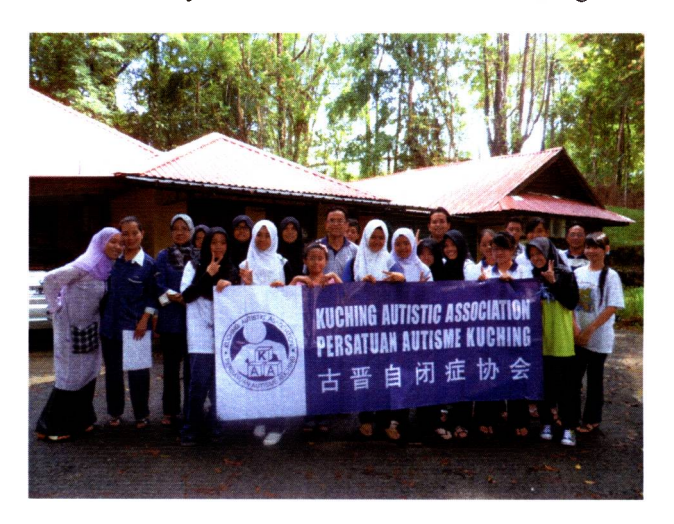
Community Service at Kuching Autistic Association