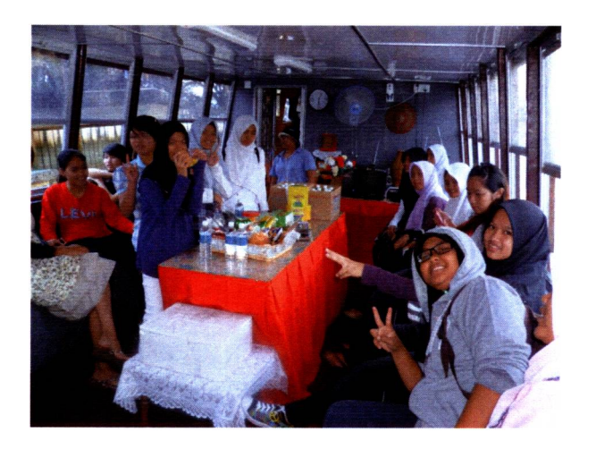
Cruising with "Lan Berambeh"