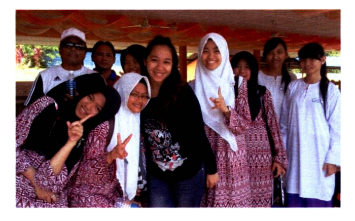
Sending off participants to their respective school