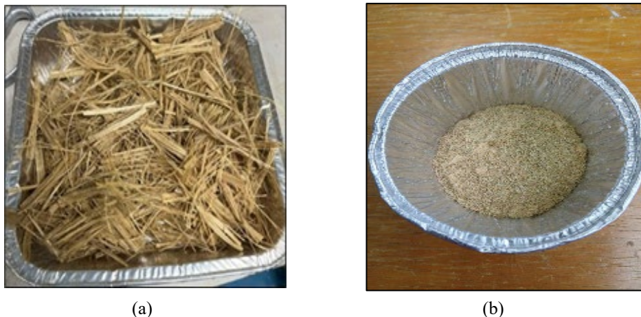
Fig. 1. (a) Semantan bamboo fibres (b) Semantan bamboo nanofibres in powder form