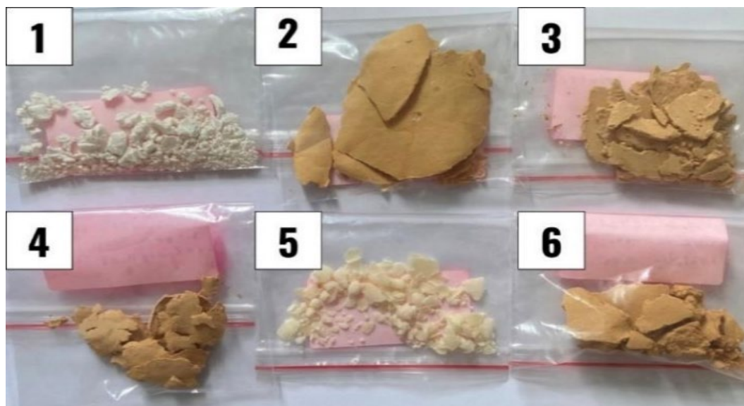
Fig. 2. Sample of extracted Semantan bamboo cellulose nanofibres of treatment no. 1 to 6