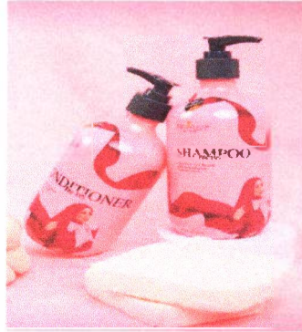
HAIR LOSS SHAMPOO & CONDITIONER

Hair loss shampoo and dandruff shampoo are very popular compared to other products because they have many positive effects on customers. Among them is to help reduce hair loss and promote hair growth. Eliminating dandruff and preventing scalp dryness makes your hair lush and black shine. This product is also for hair with severe dandruff and hair loss.