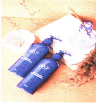
DANDRUFF SHAMPOO & CONDITIONER