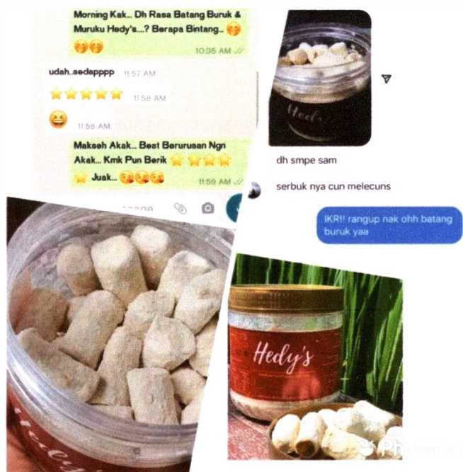
FIGURE 2.0 FEEDBACK FROM CUSTOMER AFTER PURCHASING