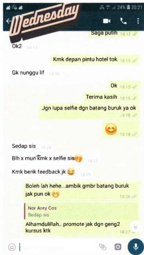
FIGURE 3.0 ANOTHER FEEDBACK FROM CUSTOMER