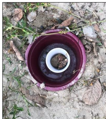
Figure 2. The samples collection activities by using pitfall trap method.

The sampling was conducted through a modification of pitfall trap methods by Woodcock et al., (2005) as shown in Figure 2 which is the best method in trapping or collecting crawling insects such as dung beetles. Other than that, this method is easy to set up and affordable (Alves et al., 2020). Each pitfall was set up systematically within a 500m distance area. 10 holes were dug using a round head hoe and shovel and the bucket (1/2 gallon) was buried at the same level as the soil in each hole. To keep the dung beetles from escaping, ¼ volumes of soap solution were filled into the bucket. A polystyrene cup with rotten fish as bait was put inside each of the buckets to attract the Onthophagus sp. Rotten fish was used as bait because it was easily obtainable. The pitfall trap was left overnight for four days per sampling session, over a period of two weeks. The samples were placed in plastic containers filled with 70% alcohol for preservation, labelled and brought to the UiTM laboratory for further processing.