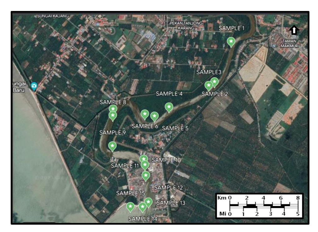
Figure 2. Sampling points.

The coordinates of each sampling point were recorded using a hand-held Global Positioning System (GPS), as depicted in Figure 2.