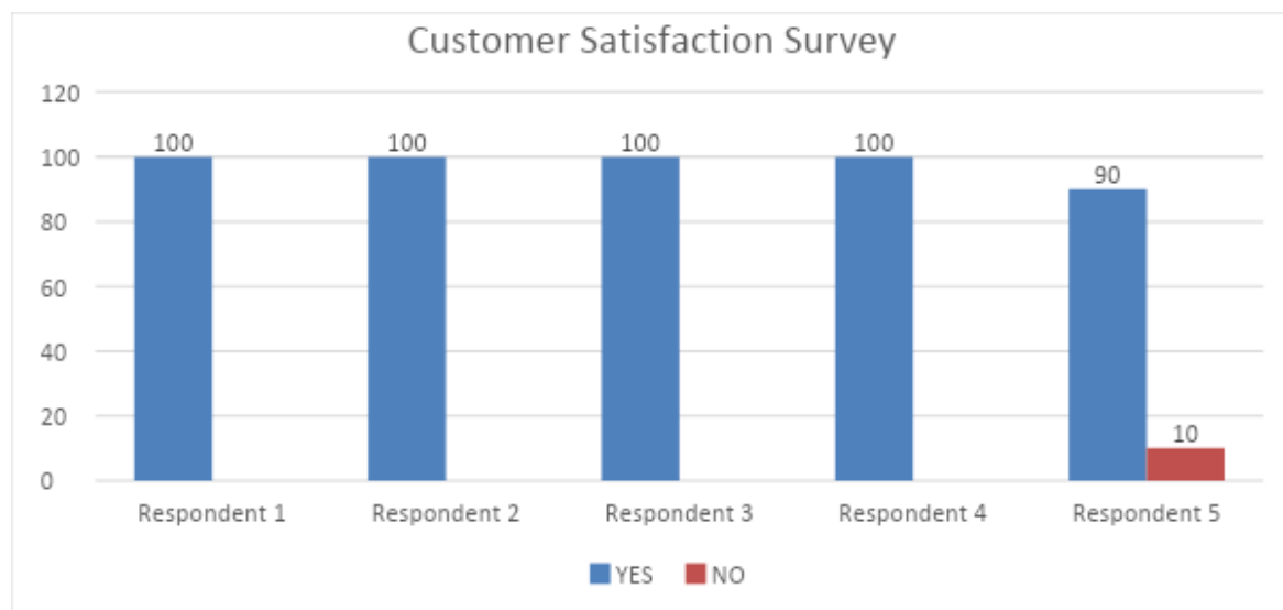
Figure 1 Customer Satisfaction Survey

Before designing the INBREL system, a thorough study must be conducted, utilizing readily available sources. This is crucial to ensure that the study's outcomes are applicable and beneficial to the target audience. Various research methods can be employed, such as analyzing previous designs, internet research, and conducting surveys. For this project, two research methods were utilized to gather the necessary information for the development of the INBREL system.