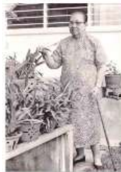
Malaysia's Golden Orchid