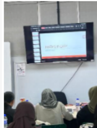
Figure 2: Students that participated in the workshop for the course MAT086