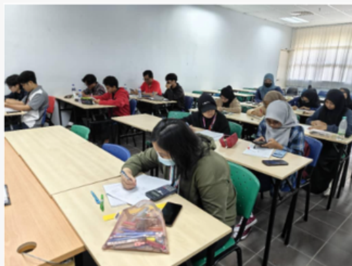
Figure 5: Students that participated in the workshop for the course MAT133