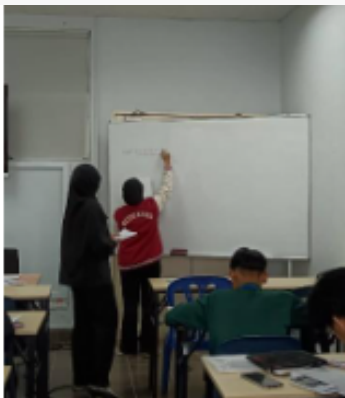
Figure 3: Students that participated in the workshop for the course MAT083