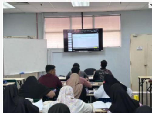
Figure 4: Students that participated in the workshop for the course MAT112