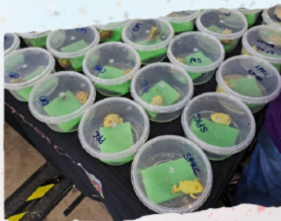
Different types of frogs were shown and sold at the Expo.

Our visit to Pet Expo Malaysia 2024 in Penang was truly a unique experience. It was a day filled with exploration, learning, and fun. Doudou enjoyed the attention and new experiences, and we left the event with plenty of new products and samples. Meeting other pets and their owners added to the enjoyment of the day. We look forward to attending more events like this and creating even more memories with Doudou and our family.