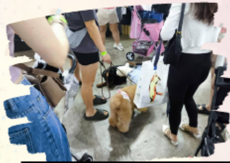
Flurry companions with their owner.

One of the highlights of the expo was the mini pet zoo, which offered a unique experience for the entire family. We saw various animals up close, including snakes, frogs, rabbits, and even alpacas. The expo was filled with cats and dogs of all breeds and we met many pet owners who were happy to share stories and tips about their furry friends. Two dogs particularly caught my eye: a beautiful, fluffy Pomeranian and a friendly Golden Retriever. I asked their owners for permission to interact with them, and they graciously agreed.