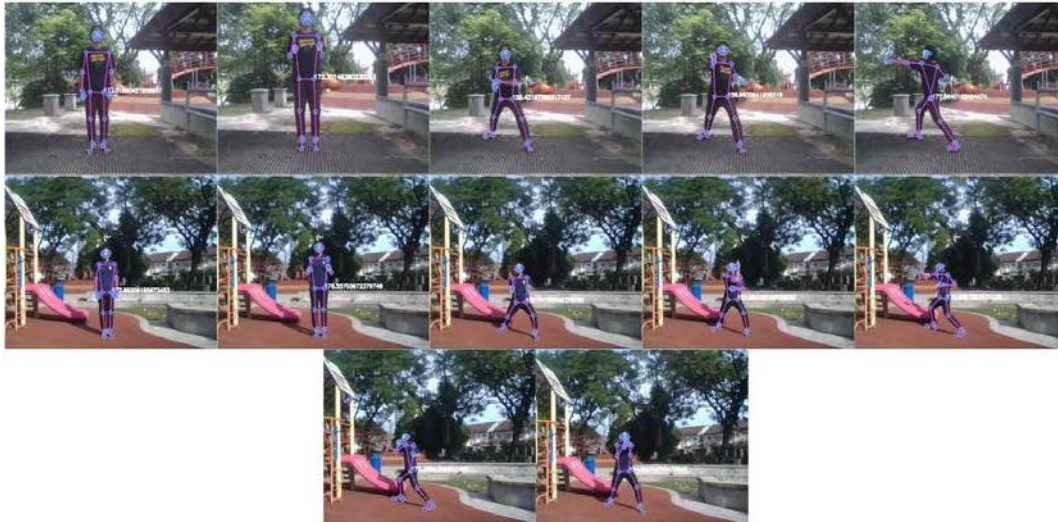
Figure 3 “Tumbuk Lurus Pintal Tali” Keypoint Landmarks