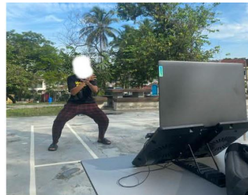
Figure 2 Volunteer performing Silat Gayong.

The Silat-AI employs a uniquely designed outdoor setup (Figure 2) to capture the intricate movements of Silat practitioners, enhancing the precision of Silat techniques classification. Utilizing a laptop equipped with a high-resolution camera, the setup is strategically placed in a park setting to leverage natural lighting and open space, which are critical for clear and unobstructed video capture. This environment not only mimics the traditional settings where Silat is often practiced but also provides a familiar and comfortable space for practitioners.