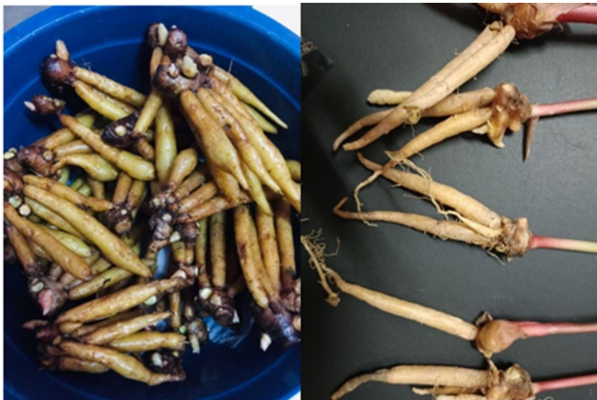
Image 2: Fresh rhizome of Boesenbergia rotunda

Additionally, a study discovered that B. rotunda might be utilised to speed up the healing of wounds because its crude