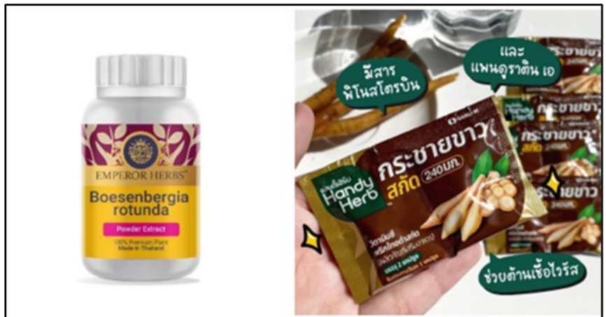
Image 4: Examples of Boesenbergia rotunda products

product is rich in essential substances which are Pinostrobin and Panduratin A that are beneficial to our body.