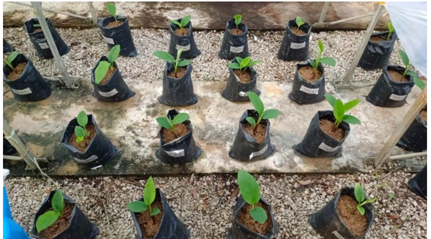
Image 3: Cultivation of Boesenbergia rotunda

Centuries of traditional use and contemporary scientific studies have validated B. rotunda 's effectiveness as a natural remedy. As B. rotunda known to have a good pharmacological activity, numerous herbal products are utilized from its secondary metabolite content to treat illness and gives wellness. Images 4 shows B. rotunda Powder Extract and B. rotunda fingerroot Galingale Extract Thai Herbal products. Boesenbergia rotunda Powder Extract is ideal for manufacturers to incorporate the powder into their own production or create custom formulations with it as an ingredient, which it is offering a 100% Extract Powder content. The B. rotunda Thai Herbal