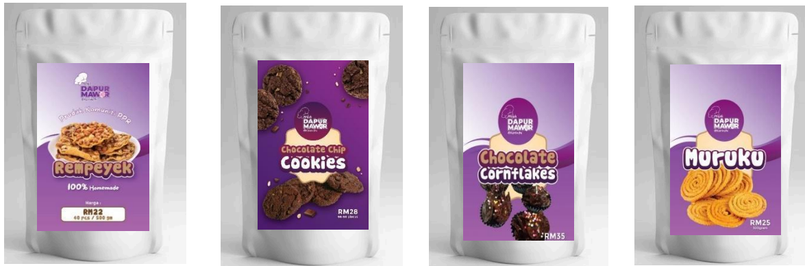
Figure 2. Sample of food packaging for Dapur Mawar entrepreneurs

incubator program that provides training in the form of theory and practical hands-on. Under the program, 23 selected local home-based entrepreneurs are guided with various training modules that meet the needs of the industry and the current market.