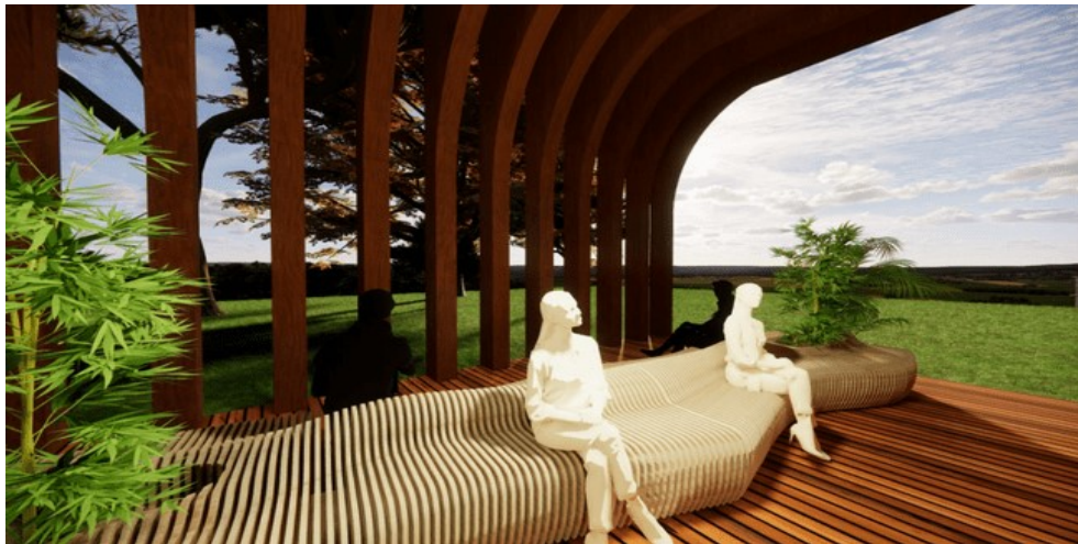
Figure 2: Top view of The Nexus Hub from leisure area