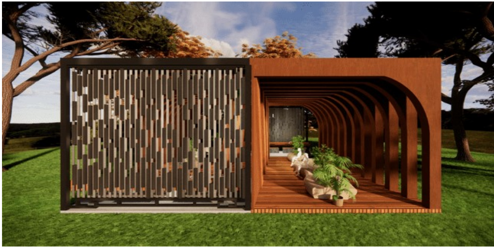
Figure 1: The Front view of The Nexus Hub