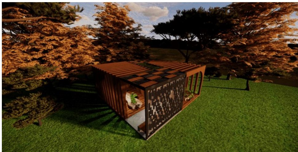
Figure 3: The view of The Nexus Hub