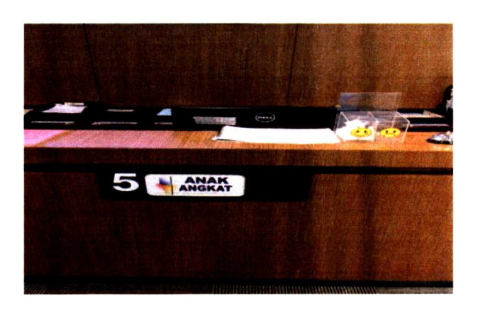
Figure 1.10: Child Adoption Counter