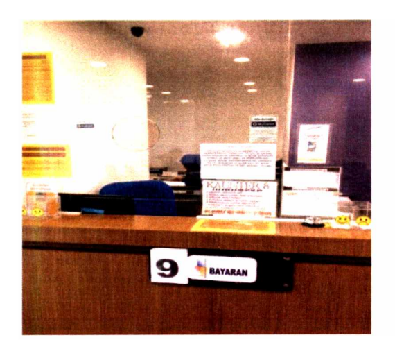
Figure 1.12: Payment Service counter