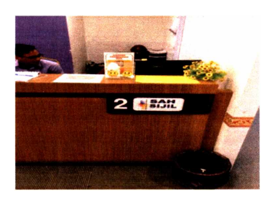
Figure 1.7: Certify True Copy Counter