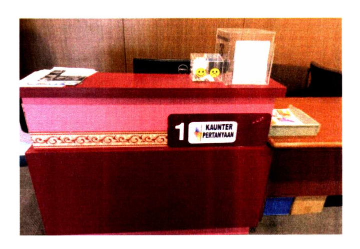
Figure 1.14: Enquiries Counter