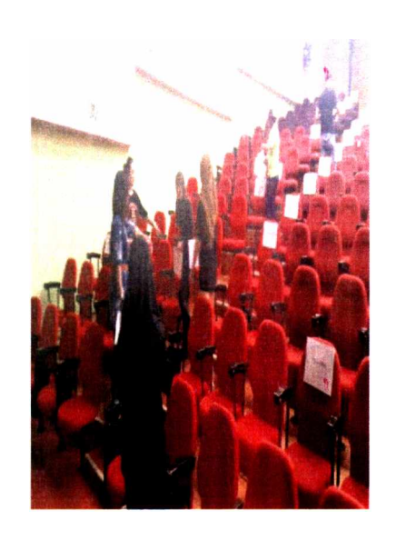
Figure 2.7: Final Preparation