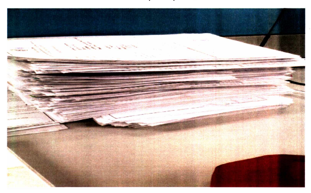
Figure 3.2 : Some of the form "Program Bantuan Rumah" need to be key in in the computer system.

On the day of this week, I was give instruction by my supervisor to incharge the Ticket counter at the morning and the certify true copy counter at the evening. Since at that day half of the staff are out of station for the purpose.