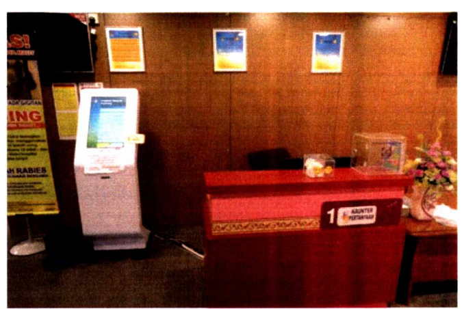
Figure 1.6: Ticket Counter

Kuching District Office used counter services in order to deliver their services to the society by using queuing system. The customer needs to print out the ticket before enjoying the services provided by Kuching District office.