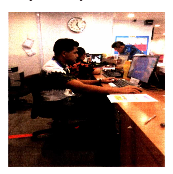
Figure 3.2: Incharge the Counter Service

On this week, I just focus on managing the front line of the organization which is counter services. This is because, one of weakness of Kuching District Office is lack of staff but the numbers of customers keep increasing from day to day. Thus, Kuching District Office really need lots of staff to incharge the counter services. On the first day of this week I was incharge the ticket counter, Certify True copy counter, Statutory Declaration Counter, and e-Kasih counter. On the next week. I Incharge the e-Kasih counter and Certify True Copy counter. The next day, I continued incharge the Certify True Copy counter and Statutory Declaration Counter. On the last day of this week, I was incharge the e-Kasih counter and Certify True Copy counter. Incharge the counter service actually give me many experiences that are very useful for me. This counter service teach me lots of lessons that I can learn from others people experience since their shared the problem with us. Choosing the Kuching District Office as the place for me to conducted my practical training is one of the best decisions that I ever made in my entire life. I might be didn't received single sen of money from the organization but the experiences and lessons I get more worth than that. I believed that, the lessons and experience I will never get if I conducted my practical training with other organization.