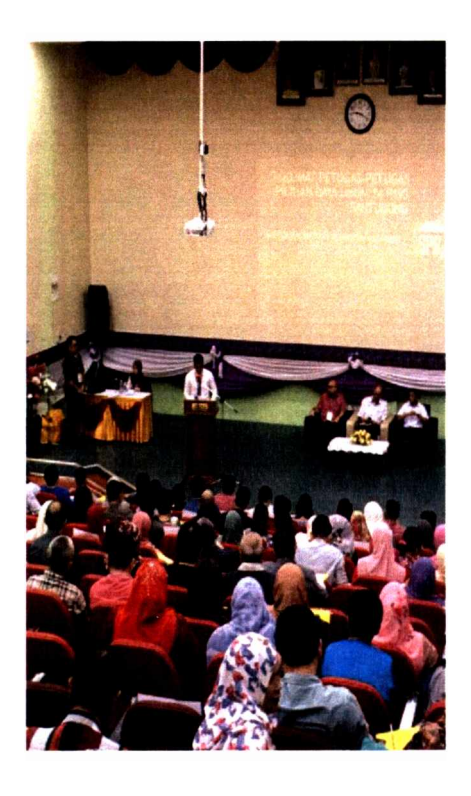
Figure 2.6: Become an Emcee