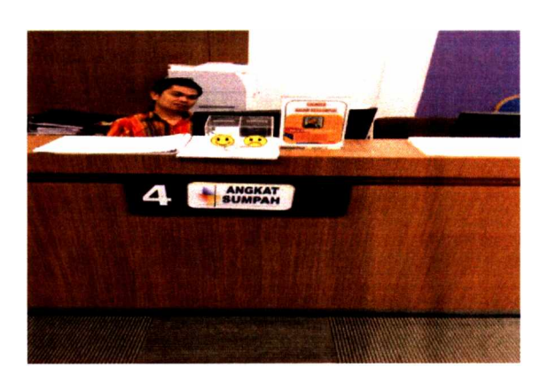
Figure 1.9: Statutory Declaration counter