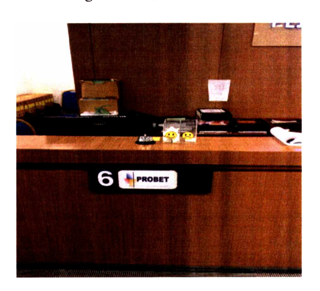
Figure 1.11: Probate counter

Then, the complete document that had been register by the officer will be bring to the back office to be key in into the system that called RNDO to get approval from district officer. Only then, the Letter of Administration or Probate Letter will be printed out and ready to claim by the applicant.