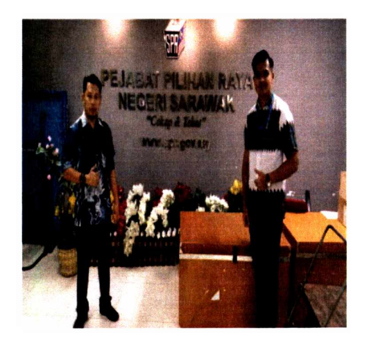
Figure 2.4: At Sarawak Election Commission.