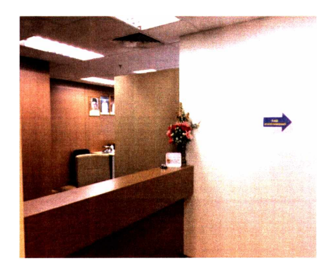
Figure 1.15: Development Department counter

This counter is use by customer to sent their company profile. The company profile is used by Kuching District Office to choose the best company to carry out the project handle by Kuching district Office. Next, this counter also provide information towards owner of the company what is the next project carry out by Kuching District Office.