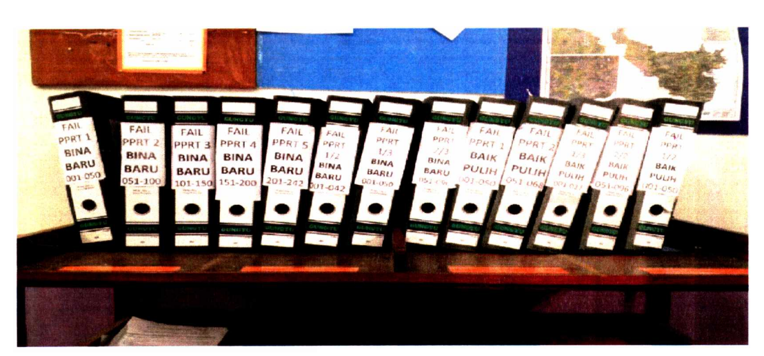
Figure 3.2: Filing for the form of "Program Bantuan Rumah"

On the last day of my practical training, I continued the filing for the form of "Program Bantuan Rumah" and praise on Allah SWT because finally I can completed it within required of time given by Sir Charles. It was good experience for me because it teach me on how to managed the time properly in order to complete the task within the required of time. Next, after lunch hour I continued my last day practical training to incharge the ticket counter and e-Kasih Counter.