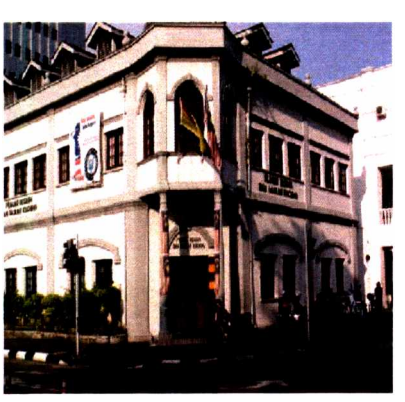
Figure 1.3: Resident and District Office (5 August 1998-16 August 2015)