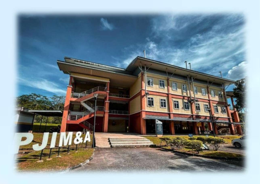
Figure 2: RICAEN Building

Officially established on July 5, 1974, UiTM Perlis is a leading public higher education institution located in Perlis, Malaysia. Starting with 258 pioneer students, it has since grown to 34 degree programs, including 17 degree programs and 16 diploma programs in seven departments. The campus is located on a 335-hectare site in Arau and features a variety of infrastructure and facilities, including 15 residential colleges, 67 science laboratories, 22 computer laboratories, and 3 language laboratories.