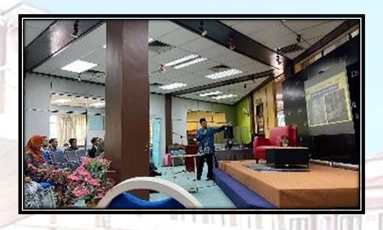
"PENGURUSAN HARTA PUSAKA ISLAM" (29/11/2023)