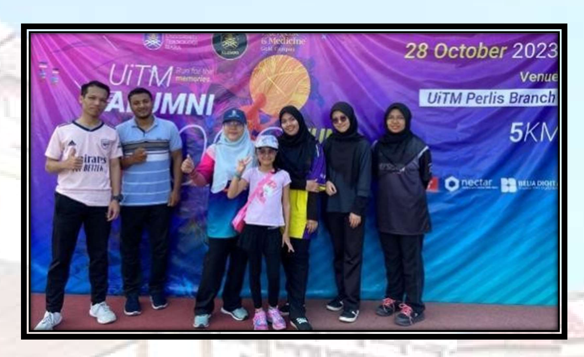
FUN RUN 2023 (28/10/2023)