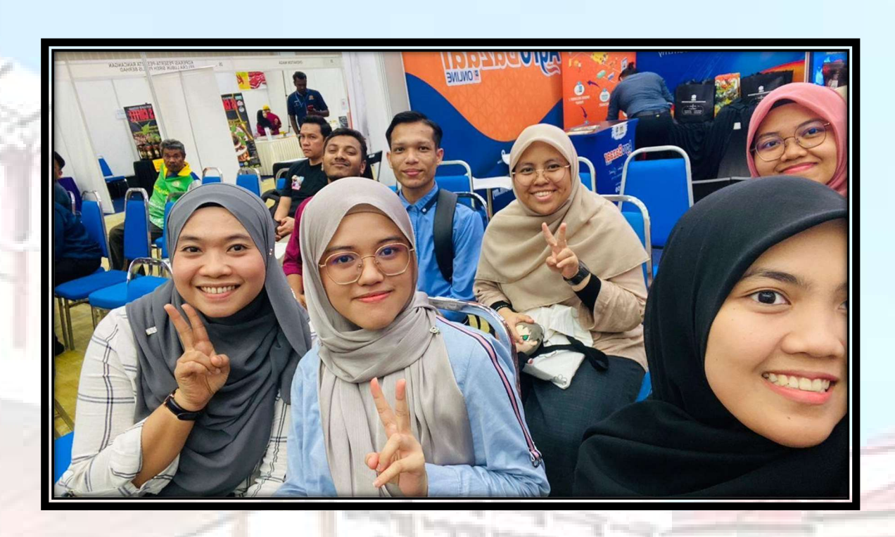
ENTREPRENEUR CARNIVAL DIGITAL BY MDEC (10/11/2023)