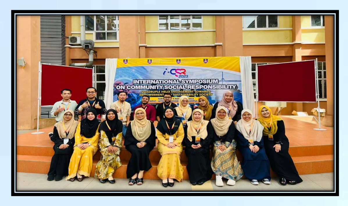
INTERNATIONAL SYMPOSIUM ON COMMUNITY SOCIAL RESPONSIBILITY (ICSR 2023)