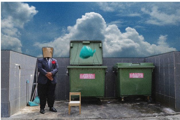
Figure 1: 'Leader' artwork

In this piece of photographic artwork (Figure 1), the artist makes extensive use of symbolism in order to convey each messages contained within the work. This is because the artist wants the people who view the work to draw their own conclusions about the meaning of the messages conveyed by the piece, making use of their existing knowledge as well as their own personal experiences.